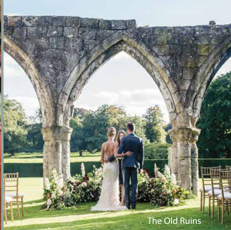
The Old Ruins