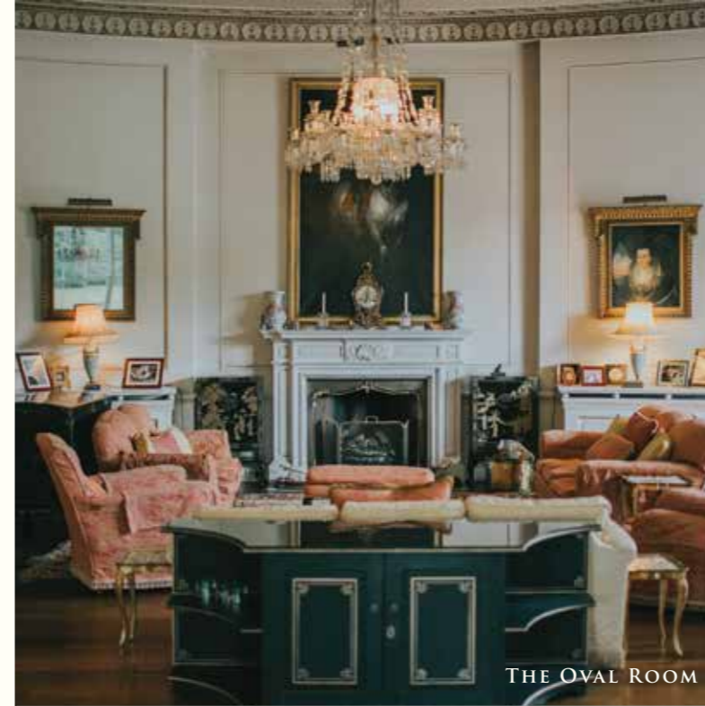
THE OVAL ROOM