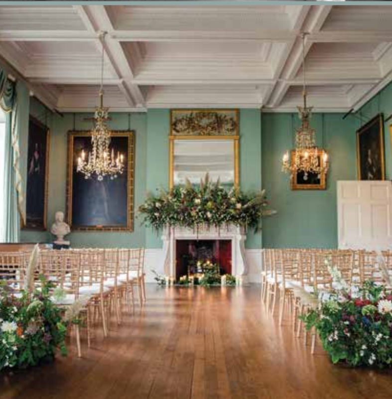
Lady Cara Willoughby