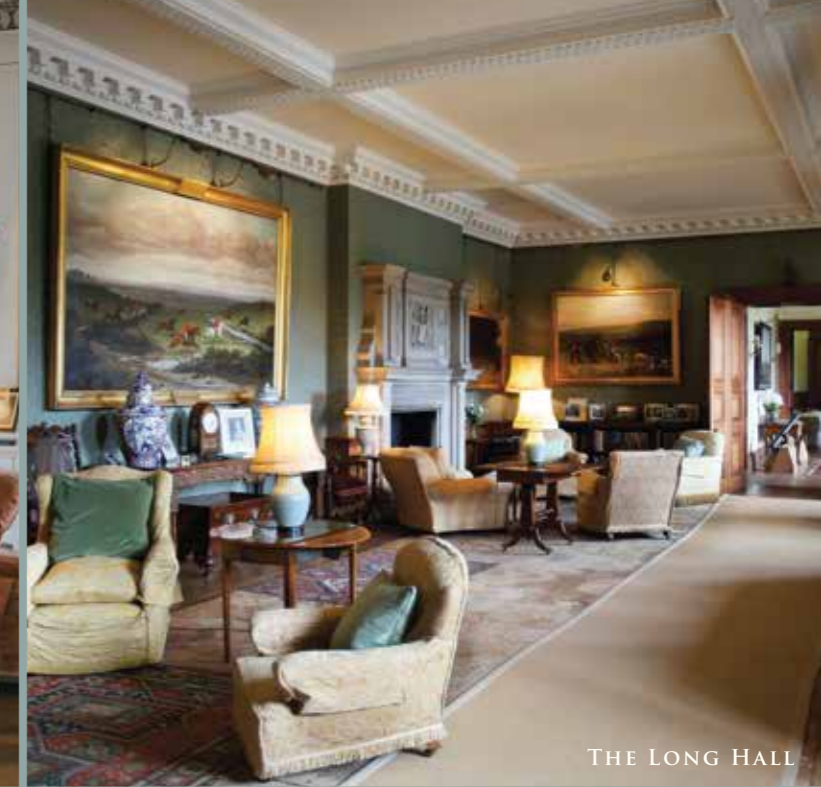
THE LONG HALL